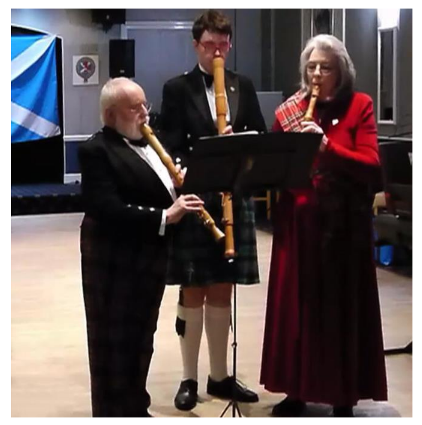
The Hardie family in complete harmony